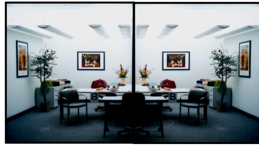
Figure 1. Identical side-by-side rooms used in a matching task. This is a simultaneous evaluation.

bias in the matching task [14] and these tend to exaggerate apparent differences between stimuli.