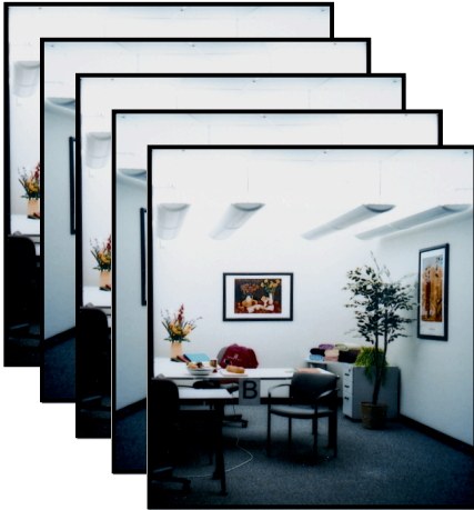
Figure 2. A single spatial location illuminated using two different sources of light in rapid succession. This is a sequential evaluation.

stimulus range bias is sufficient to affect the outcome of discrimination tasks [29,30].