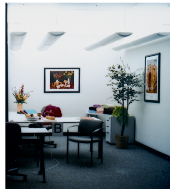
Figure 3. A single space is illuminated by one type of lamp. Judgements are made of this in isolation before proceeding to the next stimulus. This is a separate evaluation.

In the category rating task different lighting conditions are evaluated separately (Figure 3) and attributes of the visual environment are rated using a scale that gives only a limited range of fixed numbers. Poulton [31] discusses many potential causes of bias within this task. A recent review applied Poulton's ideas to research using the category rating method, and found that this method can understate the effect of lamp spectrum [32].